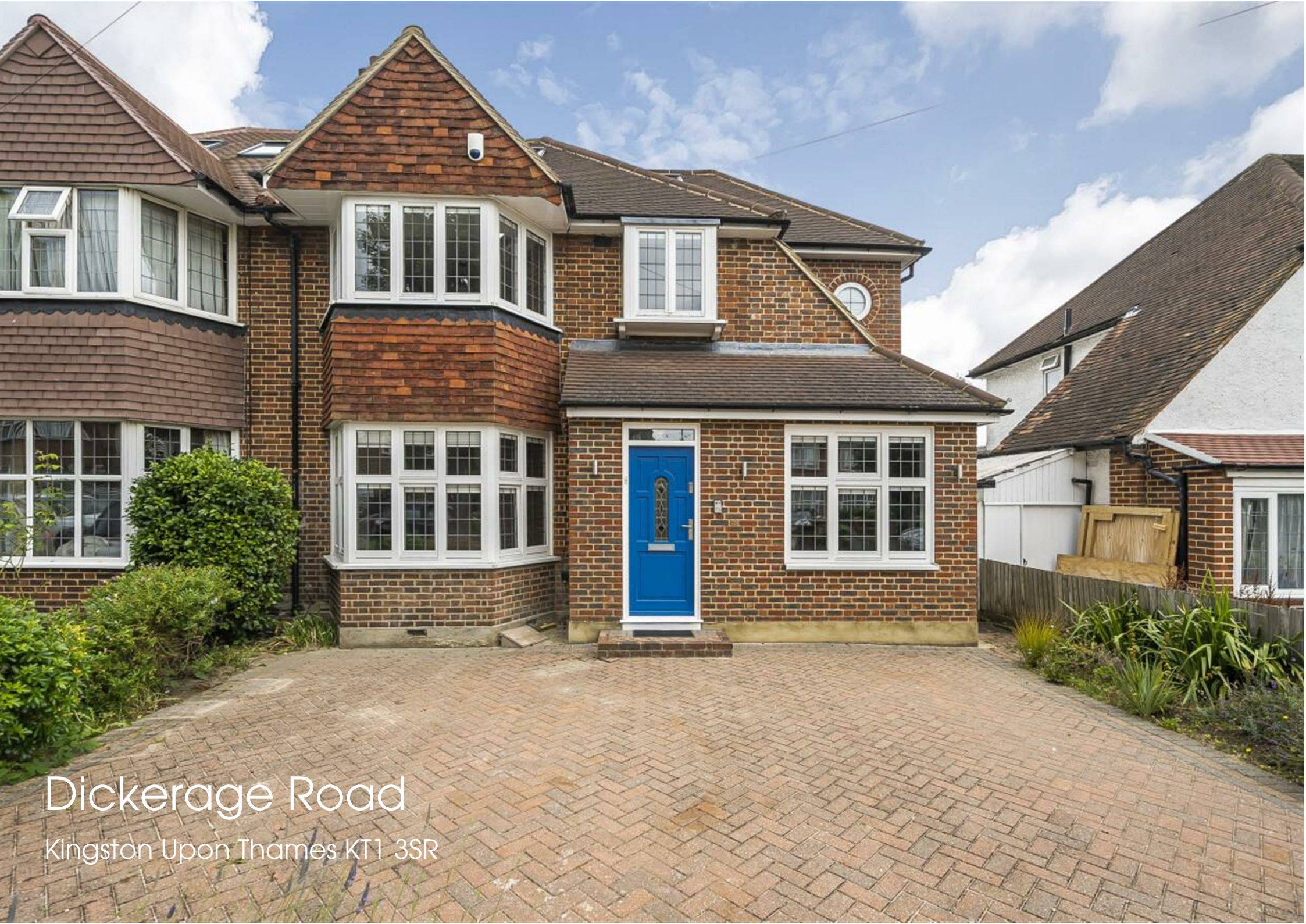
Dickerage Road Kingston Upon Thames KT1 3SR